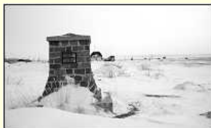
McLean Cairn – Churchill, Manitoba