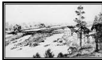
Mirick's Mills c 1840