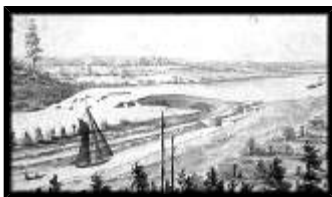
Hog's Back Dam & Locks c 1840