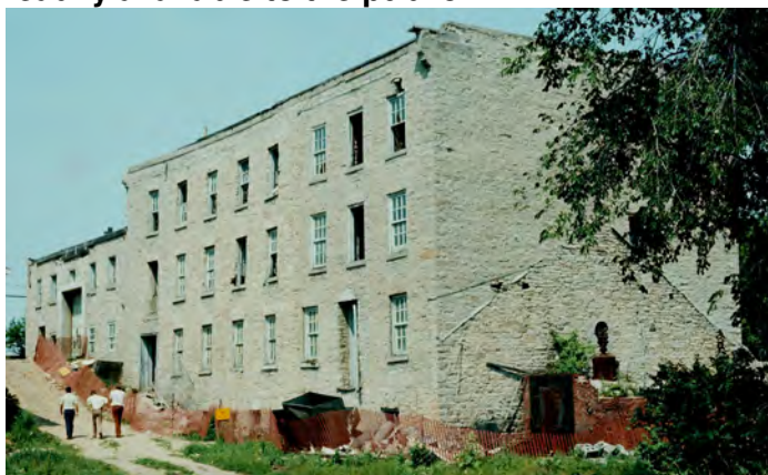
The Watchorn Woolen Mill, 1978

The Friends of the Rideau have done a great historical service by converting his research entitled "Industries and Industrialists of Merrickville 1792 – 1979" to CD and making it readily available to the public.